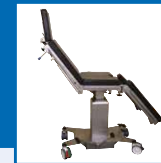
Sitting position for shoulder procedures