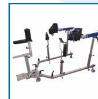
Fracture table for lower limb trauma