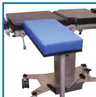
Arm table for hand and arm operations