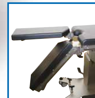
Option to remove or angle individual legs at bottom of table