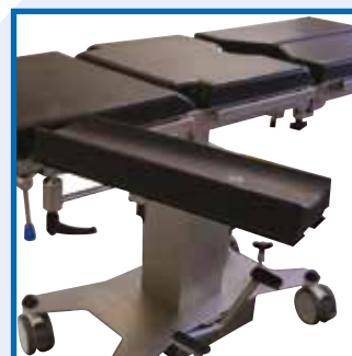
Arm board for easy IV access