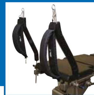
A variety of lithotomy poles are available for gynaecological/obstetric and urological procedures