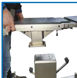
Simple to take apart for transport