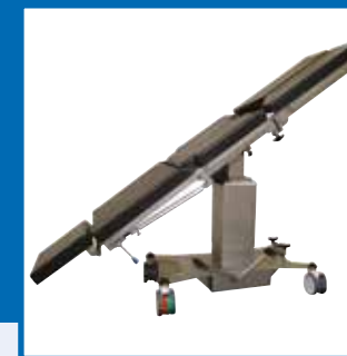
Trendelenburg to 45°, ideal for Fistula procedures