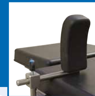
Shoulder supports for use when steep Trendelenburg is required