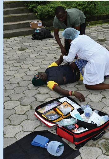
MAI Advanced Emergency Medical Bag training session, Cameroon