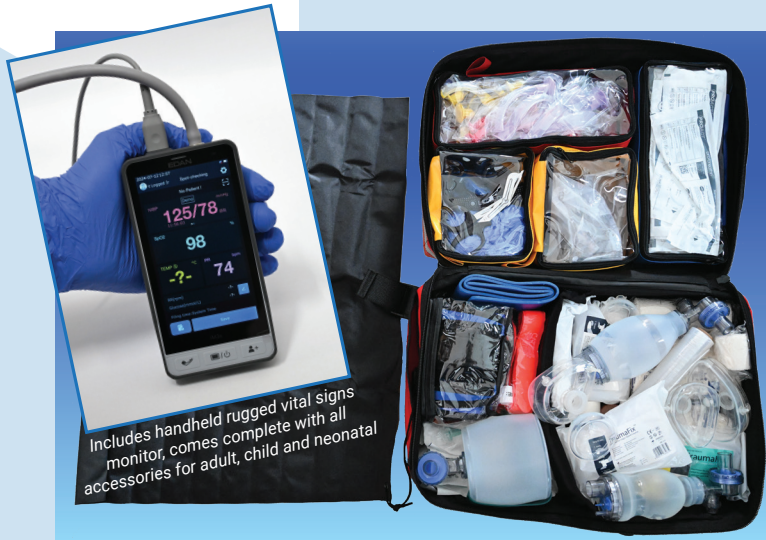
The MAI Emergency Medical Bag – ADVANCED (including fold-out nylon work surface)